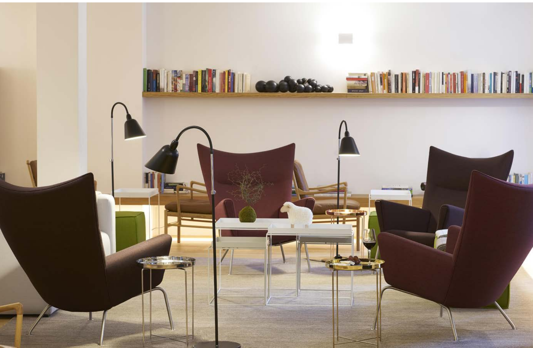
bellevue floor lamps by Arne Jacobsen - HABIBI brass, stainless steel, copper tables by Philipp Mainzer - colonial chairs by Carl Hansen - lounge chairs CH445 by Carl Hansen - 100% virgin wool rug from sheep of New Zealand, hand-knotted, Delettré