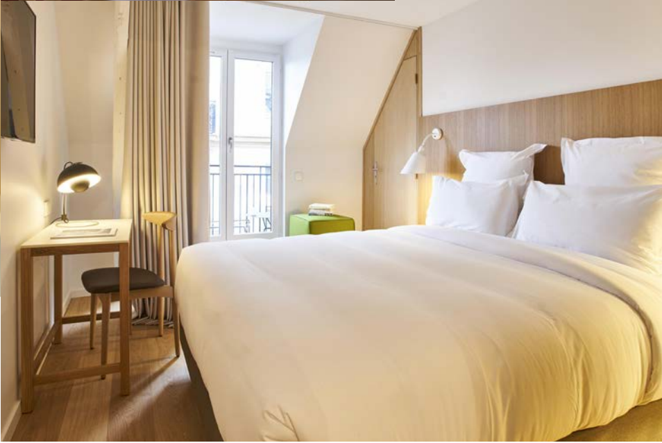
bellevue table lamp by Arne Jacobsen