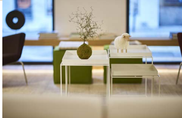
trptych and pots from Asiatides - white & grey tray tables by Hay