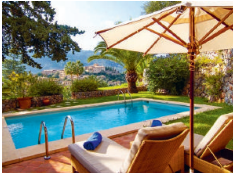
Clockwise from above One of La Residencia’s pools; inside the Presidential suite; the hotel’s traditional buildings set in beautiful verdant landscape

But they can’t stay away for long. Sunset G&Ts await on the panoramic terrace – the expertly curated cocktail list draws non-guests from Deià to sip chic concoctions on balmy summer evenings, served alongside Iberico ham, cheese croquetas and sobrassada sausage. And like them, you’ll want to keep coming back to experience the magic.