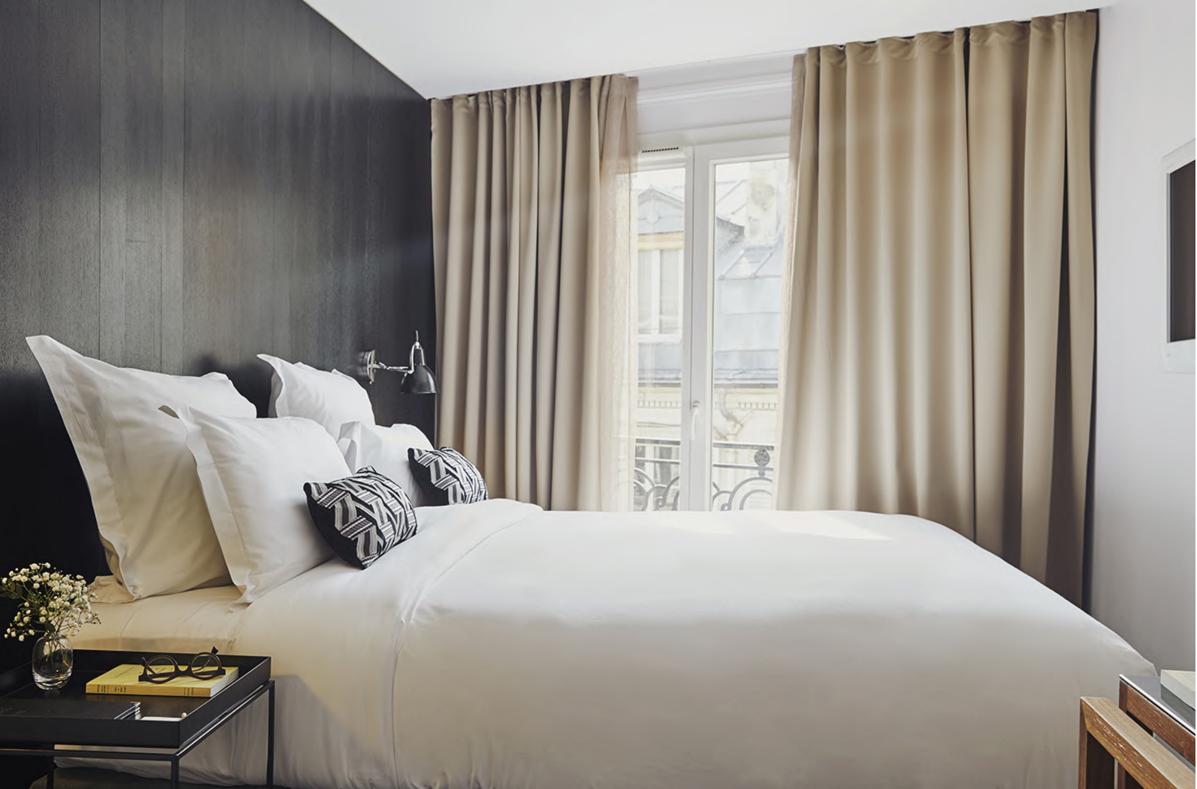
E. Bucquet wall lamp by Europa Design & Furniture - bedside table designed by Castel Veciana Arquitectura